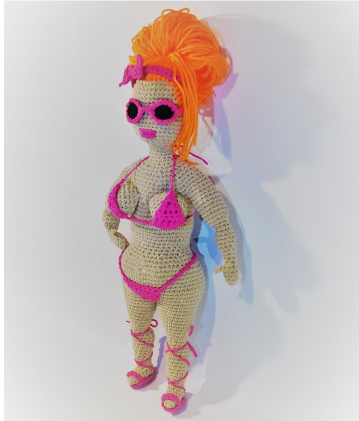
YarnArt Jeans # 59