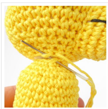
1. Sew the head to the body.

Tip! Sew the head to the body first. Use sewing pins to attach the pieces to the head and body before sewing to find the right placement and get a symmetrical result.