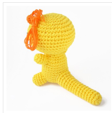
3. Sew the arms, legs and tail to the body.