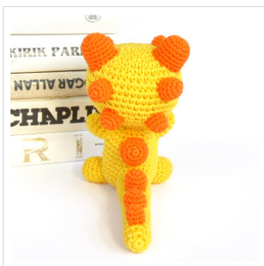
4. Sew on the spikes, starting from the nose – 1, 5, 3, 2 (in pairs), 4 (on the back), 3, 2, 1 (on the tail.)