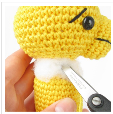
2. Add a bit more stuffing before closing the seam.