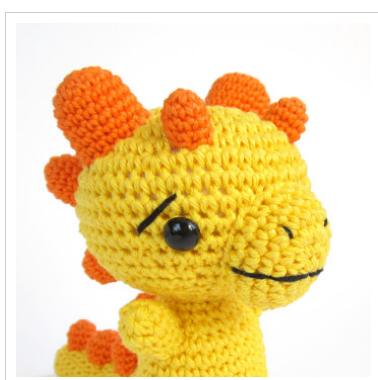
5. Add a ribbon around the neck or a bow to the head. Stitch it to place with matching thread.