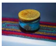
Vibrant Tank Topper Crochet Placemat