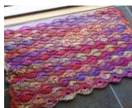
Colourful Quick Crochet Mat