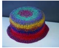
Vibrant Toilet Paper Cover