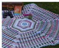
Crochet Garden Gate Afghan + Tutorial