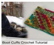
Boot Cuffs Crochet Tutorial