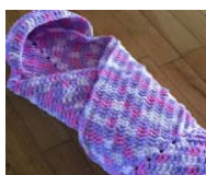
Crochet Hooded Baby Blanket