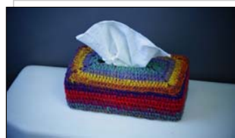
Vibrant Tissue Box Crochet Cover

I purposely designed this to fit a box of inexpensive non name tissues. The box dimensions are 8.75" x 4.25" x 3" tall.