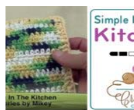
Crochet Simple Dishcloth + Tutorial