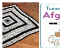
Crochet Tunnel Vision Afghan + Tutorial