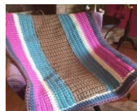
Mega Bulky Crochet Throw