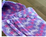
Crochet Cuddly Snuggly Hooded Baby Blanket