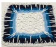
Crochet Icy Window Afghan