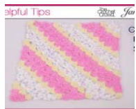
Corner to Corner Stitch