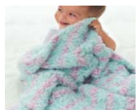
Corner to Corner Fuzzy Baby Blanket