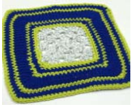
Picture Frame Granny Border Pattern