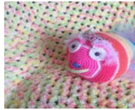
Easy Baby Crochet Blanket + Tutorial