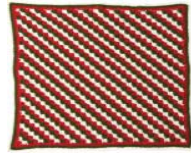
Corner to Corner Christmas Diagonals