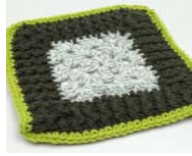
Rib Stitch Granny Square Border Pattern