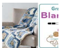
Crochet Bernat Bundle Denim Blanket