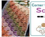
Corner To Corner Scarf + Tutorial