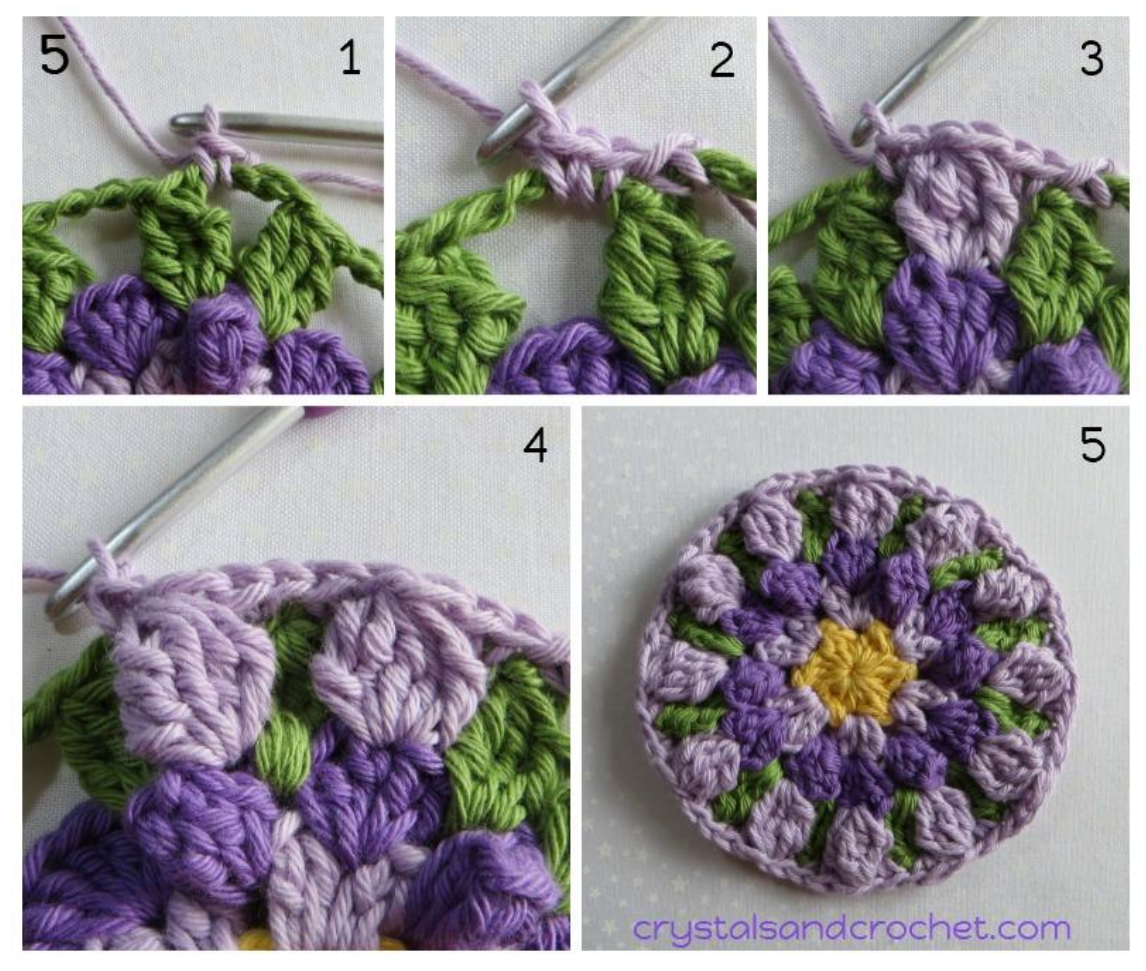
6. Join with a standing fpsc around any 5-tr-cluster, [P1] (skip next st, 4 dc in next 2 sts, skip next st, fpsc around next 5-tr-cluster) 12 times, omit last fpsc. [P2,3]

Join to standing fpsc, fasten off, and secure ends. Stitch count: 12 fpsc, 96 dc.