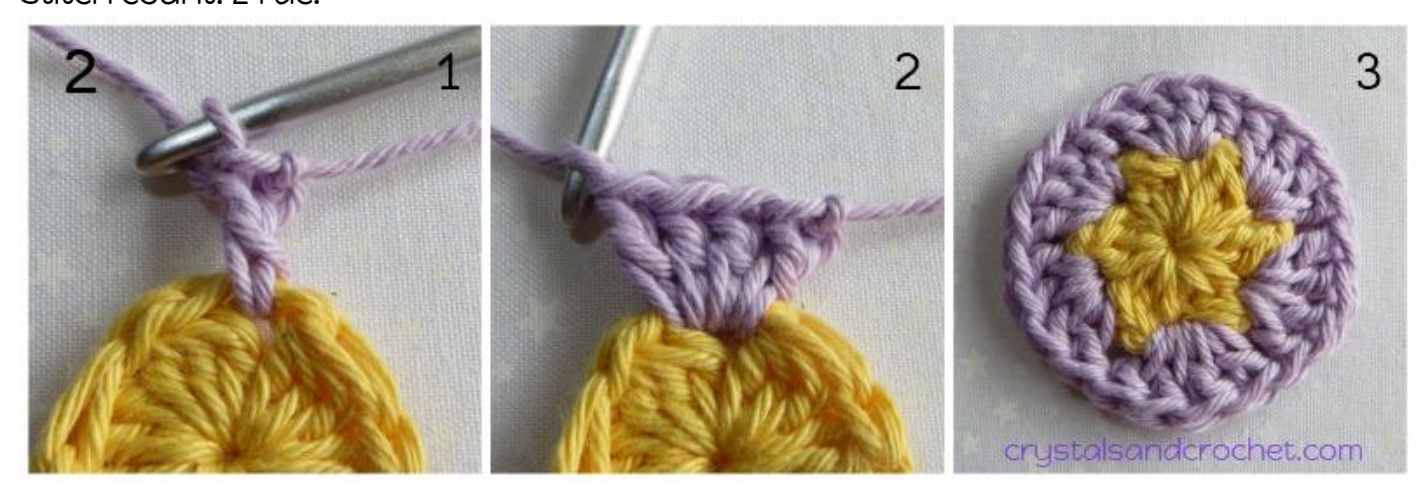
3. Join with a beginning popcorn between any 4-dc groups, [P1] (skip next 2 sts, 5 dc between 2<sup>nd</sup> and 3<sup>rd</sup> dc, skip next 2 sts, popcorn between dc groups) 6 times, omit last popcorn. [P2,3] Join to beginning popcorn, fasten off, and secure ends. Stitch count: 30 dc, 6 popcorns.

2. Join with a standing dc in any ch-1 space, 3 dc in same space, [P1,2] (skip next cluster, 4 dc in next ch-1 space) 5 times. [P3] Join to standing dc, fasten off, and secure ends. Stitch count: 24 dc.